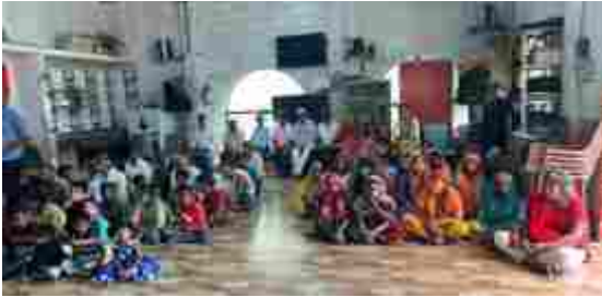
Visit to Immanuel Mercy Home