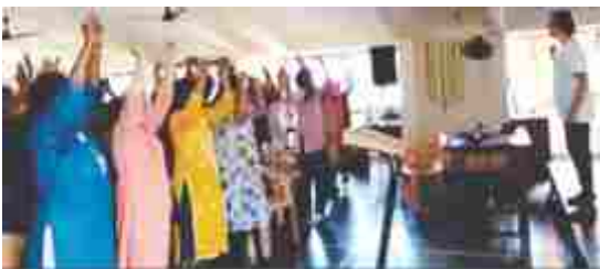
Activity by members