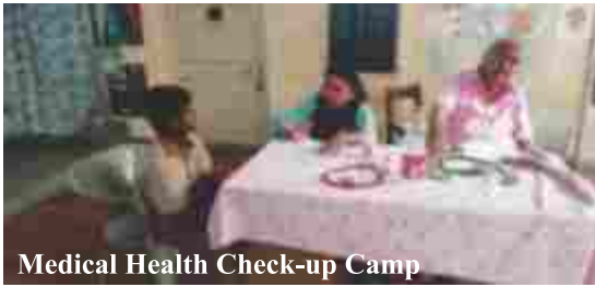
Medical Health Check-up Camp